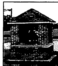
District No. 5 Schoolhouse Bell